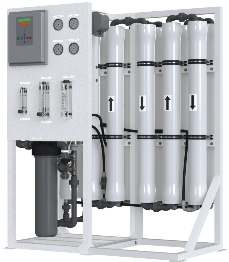
R1 – 12140 Reverse Osmosis System