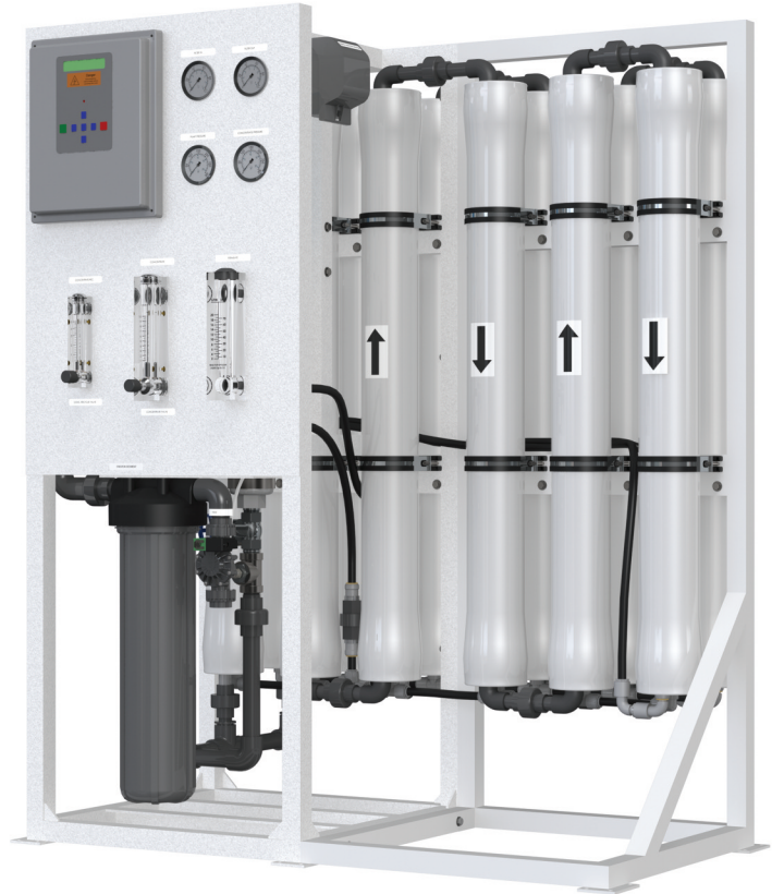
R1 – 12140 Reverse Osmosis System

R1 – Series Reverse Osmosis Systems have been engineered for capacities ranging from 1,800 – 21,600 gallons per day.