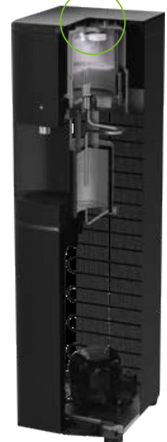
UV LED UV care

Pure Water Systems Inc. 245 Vine St, Reno, NV 89503 office@renowaterfilters.com www.renowaterfilters.com