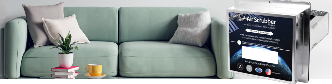
New Patented Cell Design

Air Scrubber BY AERUS WITH CERTIFIED SPACE TECHNOLOGY™