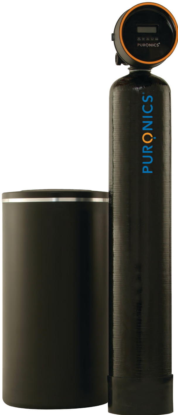
Hair and skin are soft and silky

The Puronics® Defender™ C (with Chloroshield™ Clearess™ media) utilizes our proprietary Chlorostatic™ Technology to reduce the levels of chloramine, chlorine and hardness typically found in municipal water supplies. Chloramine is a common municipal water disinfectant, but is corrosive to lead and copper water lines and could have possible side effects for people and fish. This whole-house water conditioner combines the advanced technology of the intelligent iGen® control valve and a durable fiberglass media tank to provide superior quality, healthy water for years to come.