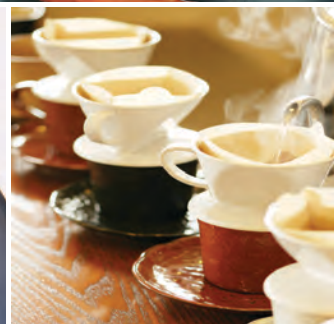
Better tasting beverages