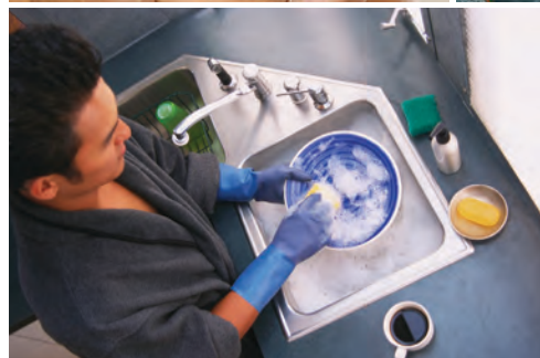
Dishes are cleaner